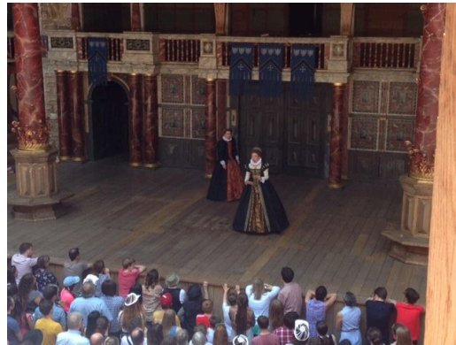
Above: Enjoying theater in London's West End; seeing "As You Like It" at the Globe Theater.